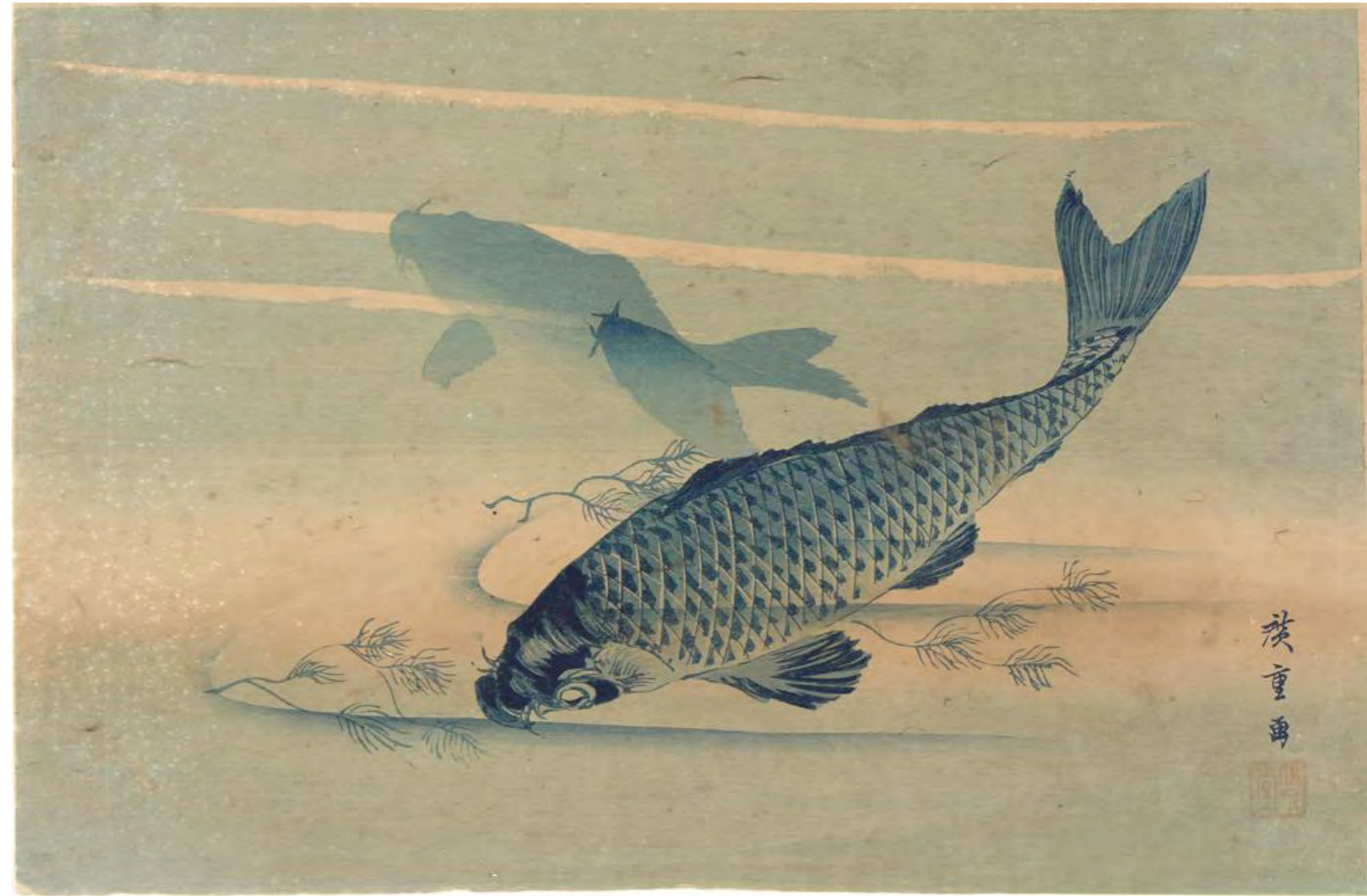
Image | H x W | 24,5 x 37,4 cm | 9.6 x 14.7 inches Sheet | H x W | 44,3 x 57,4 cm | 17.4 x 22.6 inches