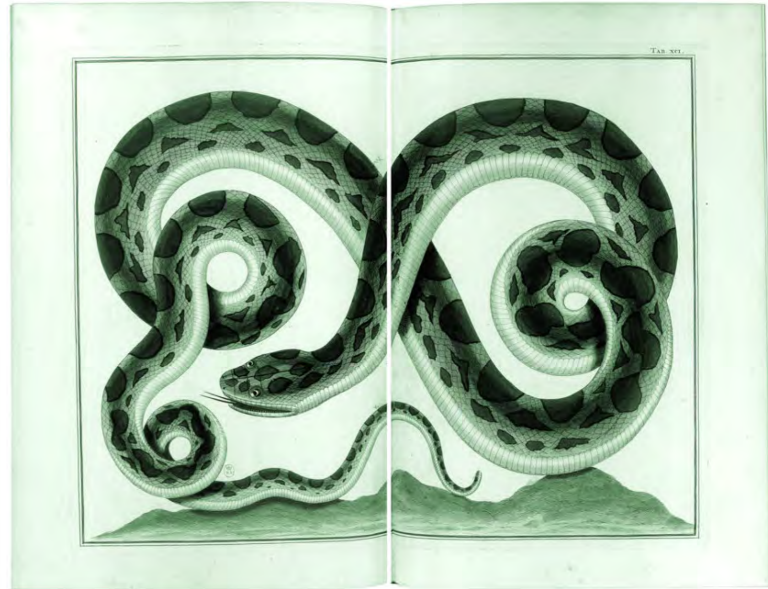
Image | H x W | 48,5 x 63,5 cm | 19.1 x 25 inches Sheet | H x W | 69,7 x 84,8 cm | 27.4 x 33.4 inches